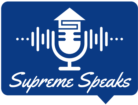
Use with solid darker or contrasting backgrounds.