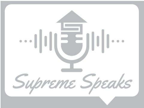
Use with dark pattern backgrounds.