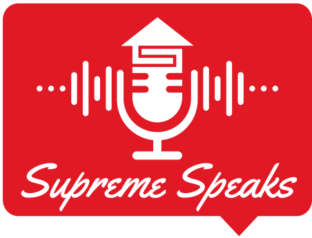
Use with solid darker or contrasting backgrounds.