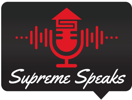
Use with solid light backgrounds.

Primary Logos - follow specific guideline listed below for each mark.